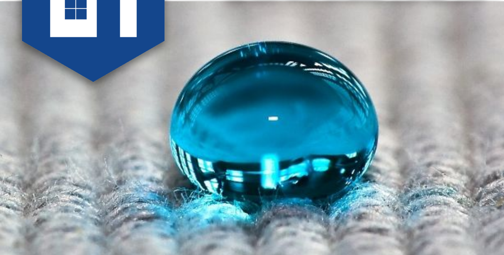
WATER DROPLET STANDING ON TEXTILE MATERIAL PROTECTED WITH NANOTECHNOLOGY

FOR THE USE ON > CLOTHING AND FOOTWEAR OF TEXTILE AND SUEDE, PAPER, PAPERBOARD OR NATURAL WOOD